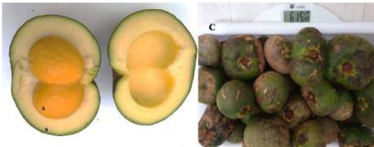
Figure 1. C. brasiliense fruit sectioned, showing the almond with the yellow oleaginous pulp (A) and the peel (B); closed ripe fruits (C).

worms, headache, colic, constipation, diarrhea, pharyngitis, anemia, pruritus, kidney stones, bladder stones, bacterial infections, fungal infections and neoplasms (França et al., 2008; Gupta and Gupta, 2020). Historically, plant products have been used since prehistory for medicinal purposes and have passed through time being used until today (Souza and Rodrigues, 2016). In the last decades, important discoveries have been made about new phytotherapeutic properties of various plants, so that the interest and search for natural active principles with potential for use by the cosmetic and pharmaceutical industries are growing (Amaral et al., 2014).