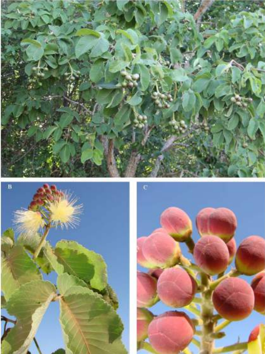
Figure 3. C. brasiliense tree top section showing branches with leaves and unripe fruits (A); branch detail with trifoliolate composite leaf and crenate margin leaflets, and open flowers with many stamens (B); details C. brasiliense flower buds (C).

According to Ferreira et al. (2011), the main fatty acids present in pequi oil are oleic, palmitic, gallic and quinine