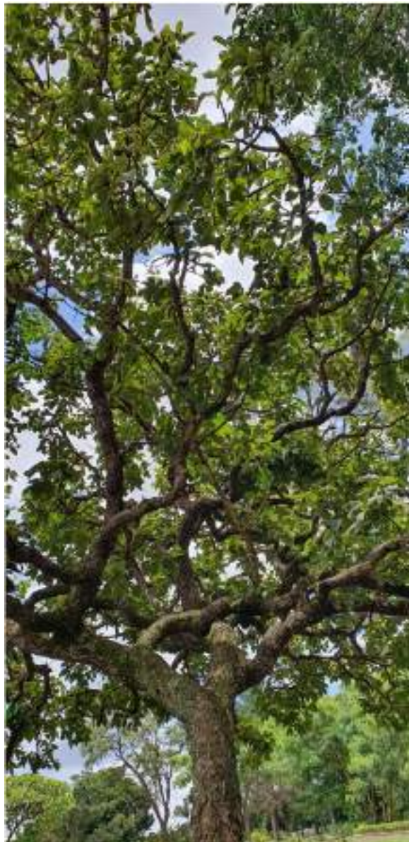
Figure 2. C. brasiliense tree, in a private area in the Midwest region of Brazil.

use of plant compounds can present toxicity and be harmful to health (Souza and Rodrigues, 2016). The objective of this work was to carry out a systematic study of scientific productions that explored the therapeutic potential of C. brasiliense , in order to summarize and harmonize the results of research in the last ten years, which sought to validate its medicinal use.